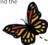
STATE INSECT Monarch Butterfly

CAPITOL refers to the building where the legislature meets, and CAPITAL refers to the city.