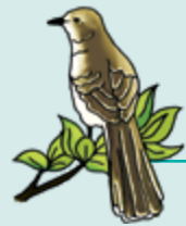
STATE BIRD Mockingbird