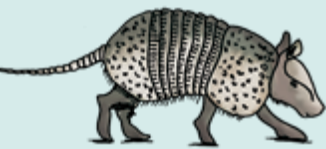
STATE SMALL MAMMAL Armadillo