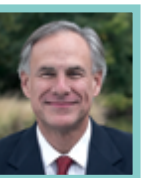
Governor Greg Abbott

The Governor is the head of the Executive branch and the leader of the State, working with State Senators and State Representatives to pass laws that will help citizens of Texas. All bills must pass through the Governor's office, where it will be signed into law or vetoed.