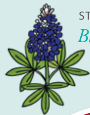
STATE FLOWER Bluebonnet